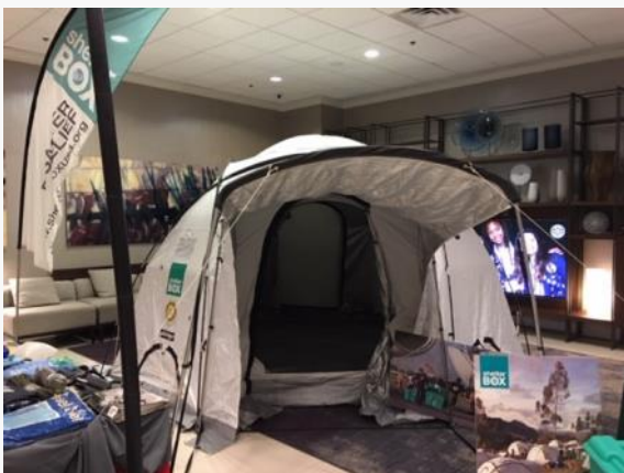
Accommodations were nice.