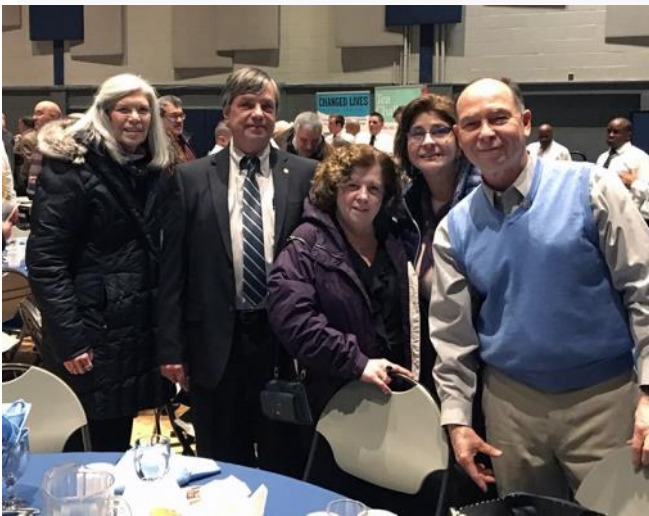
NHRC was well represented at the Teen Challenge Dinner.